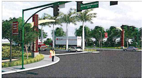
Intersection of MLK and Australian looking south and east- RBH Plan