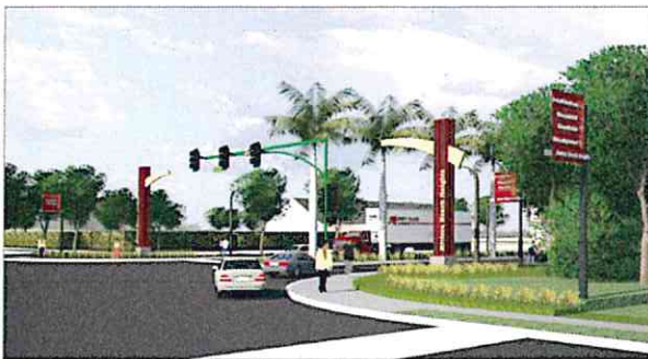
Intersection of MLK and Australian looking north and east RBH Plan

The Riviera Beach Heights plan identifies this corner project for future significant gateway signage and wayfinding signage. These elements will be added in phase two following completion of the roadway reconstruction. The concept for the future phase is shown below: