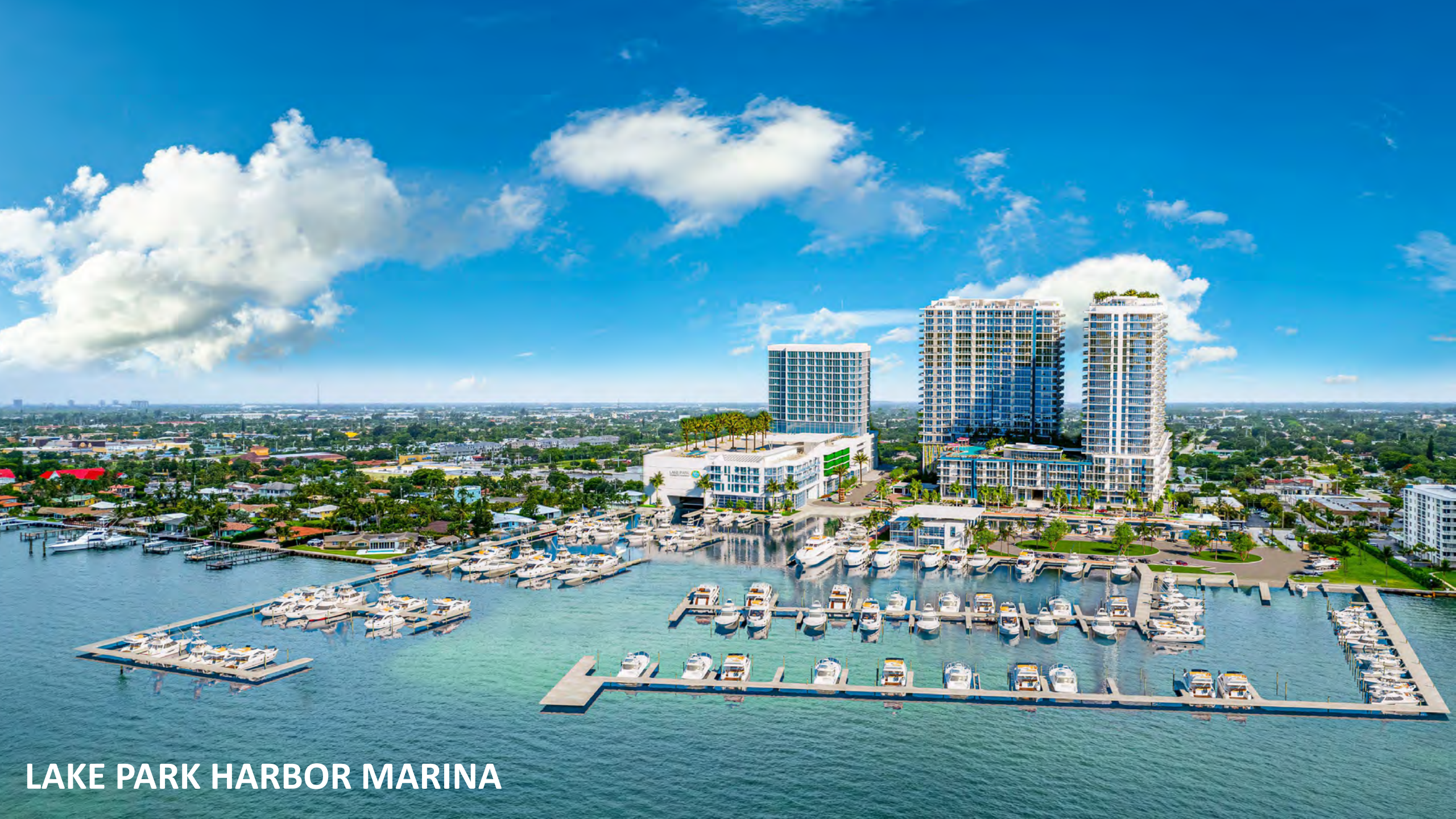
LAKE PARK HARBOR MARINA