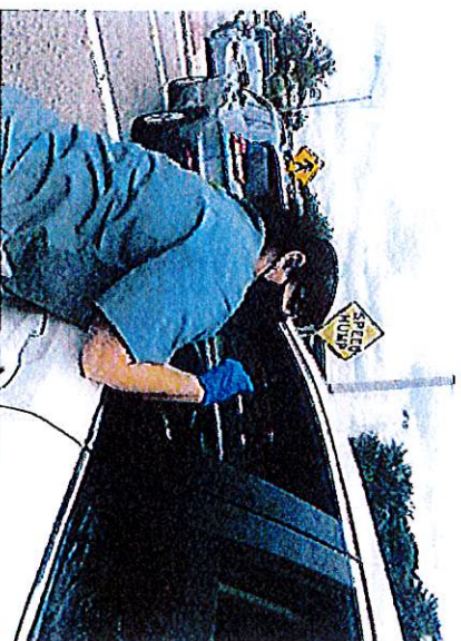
In collaboration with L.O.T. Health Services to provide free COVID-19 testing during food distribution.