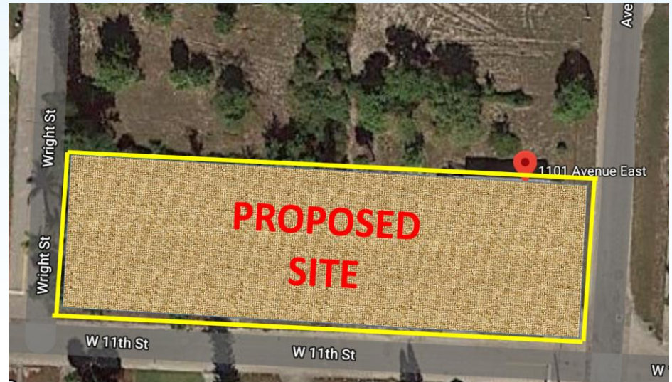
Proposed Site Located on the NW Corner of Ave E & 11 th St