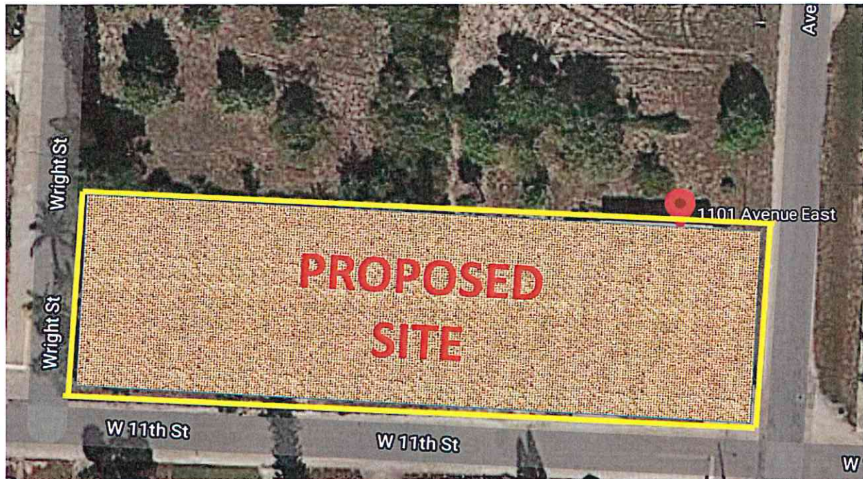
Proposed Site Located on the NW Corner of Ave E & 11 th St

We are poised to move forward more aggressively with residential development for rehabilitation and new construction for homeownership. The Agency has partnered with Riviera Beach CDC to create and expand homeownership for our residents.