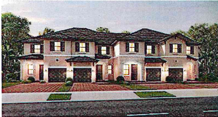
Townhouse Prototype - Front

The Agency is requesting the Board of Commissioners to provide feedback and support for the proposed townhouse project, located on 11 th Street between Wright Street and Avenue "E."