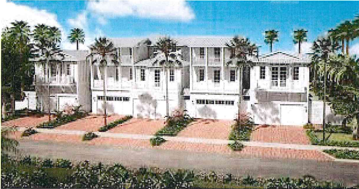
Townhouse -Coastal Prototype