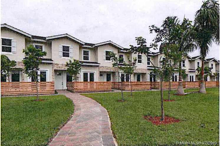
Townhouse Prototype - Rear

development, resident prosperity, and improved quality of life. We are endeavoring to develop a Sense of Place. We truly believe that in this time, Riviera Beach is “The Place to Be.”