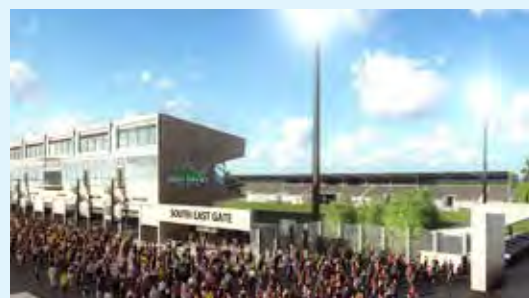
Atlanta Sports City Soccer Stadium