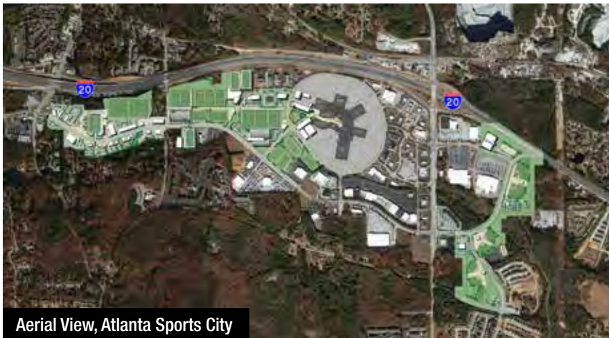
Aerial View, Atlanta Sports City

We are actively involved on all fronts, which is what makes the collaboration between the entities effective. It creates the capacity to be responsive while the interest is high. We have