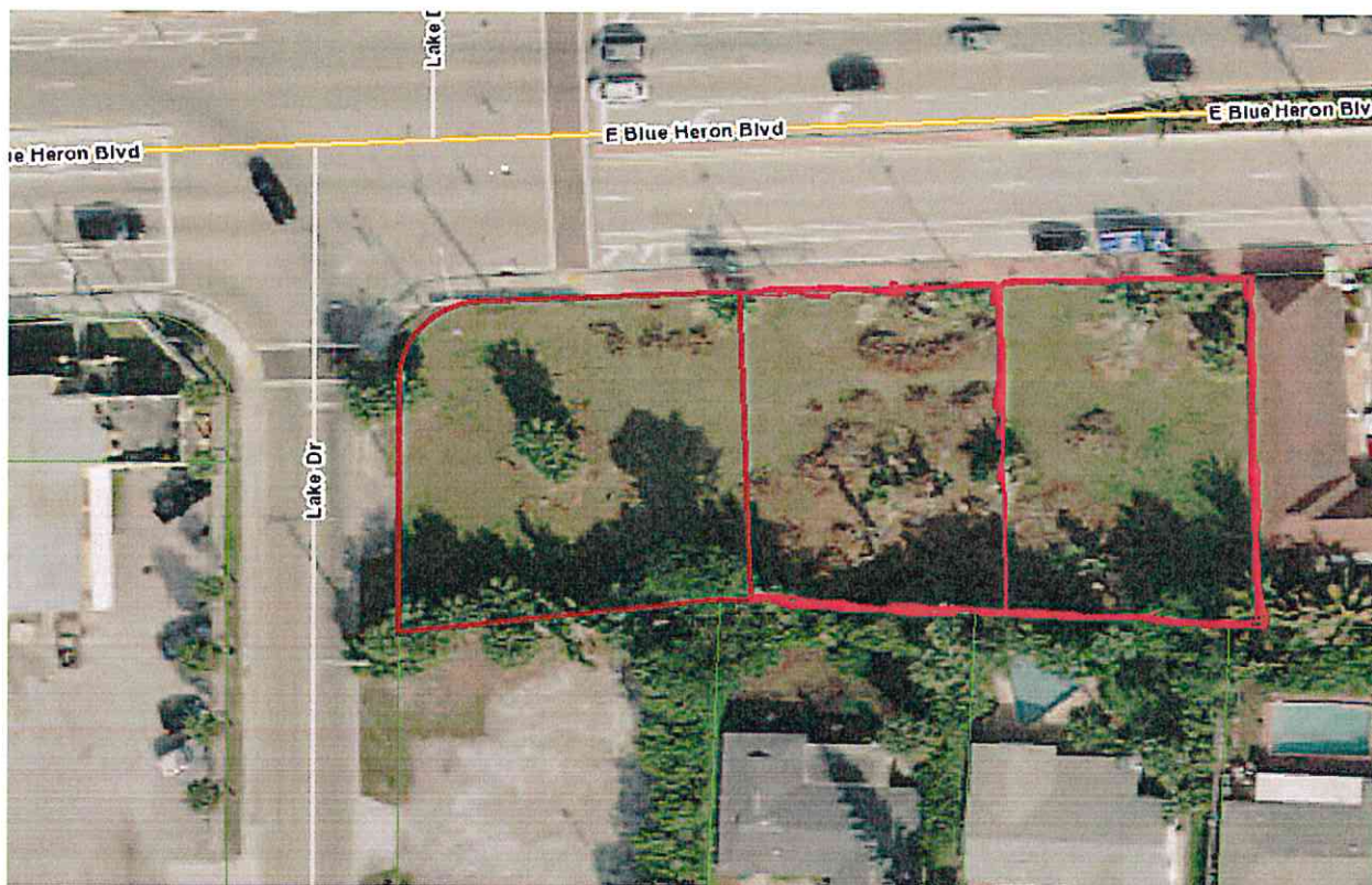
Singer Island Community Garden Park at South East Corner of Blue Heron and Lake Drive, Riviera Beach, FL