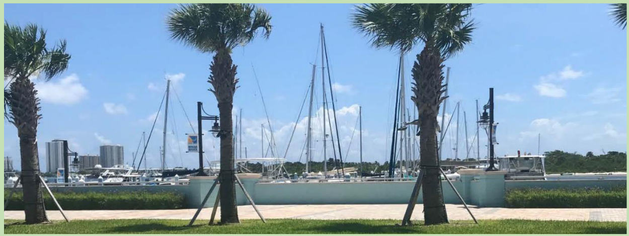
WAVE RAIL OPTION 1 BID AMOUNT= $203,624.00