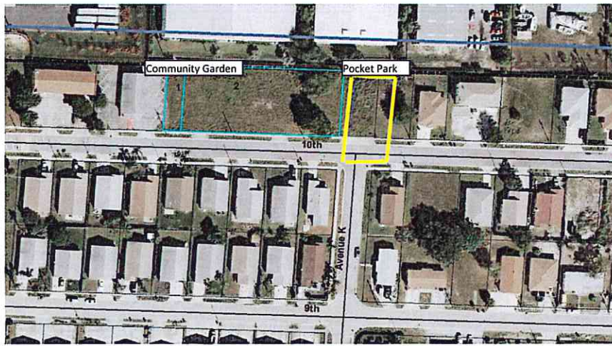
Riviera Beach Heights Community Garden at 10 th and K Street, Riviera Beach, FL and adjacent Pocket Park without improvements