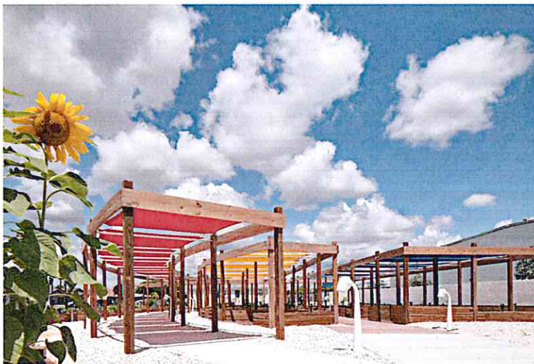
Riviera Beach Heights Community Garden at 10 th and K Street, Riviera Beach, FL and adjacent Pocket Park with improvements