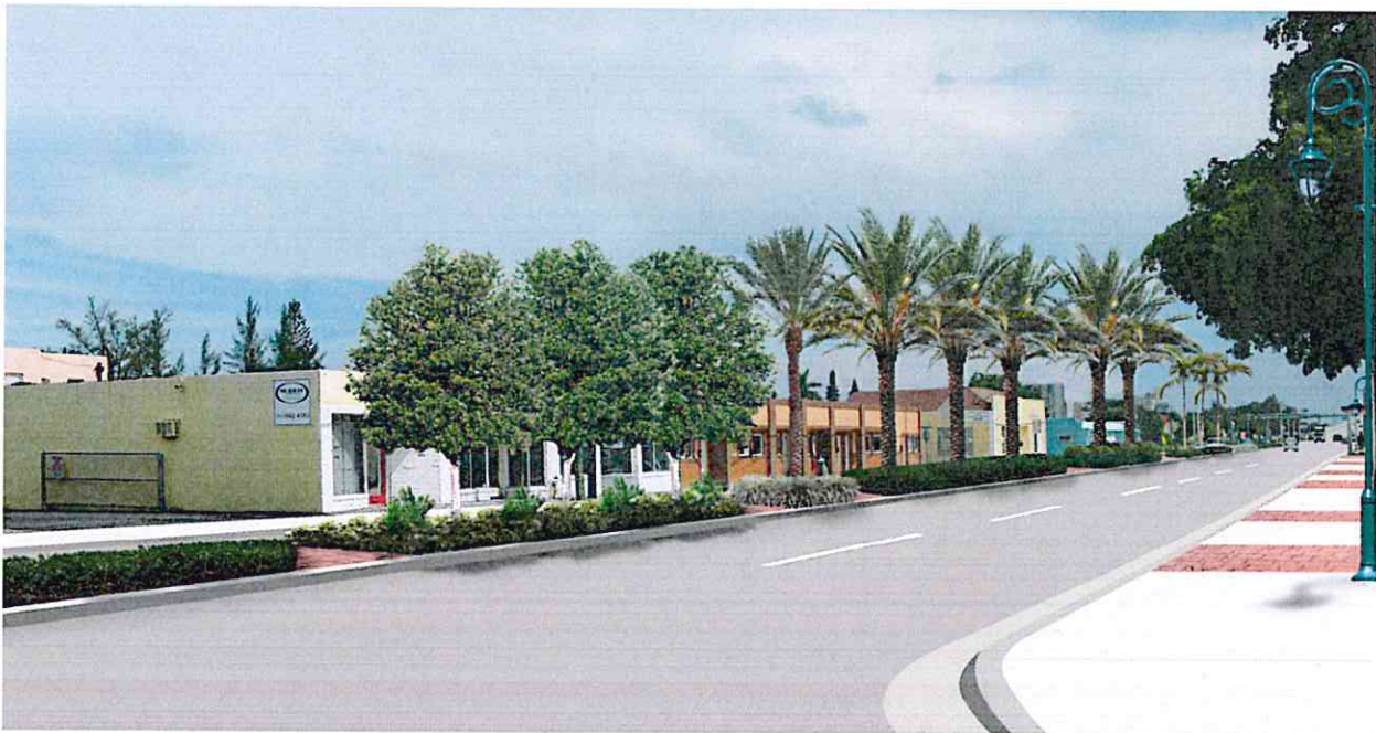
Broadway/US-1 after Utility Burial and Street Improvements (Landscaping, Decorative Lighting) The Street Improvements have been completed. The next phase of lighting improvements includes new decorative pedestrian lighting on the East side of Broadway scheduled to follow the completion of the Utility Burial Project.