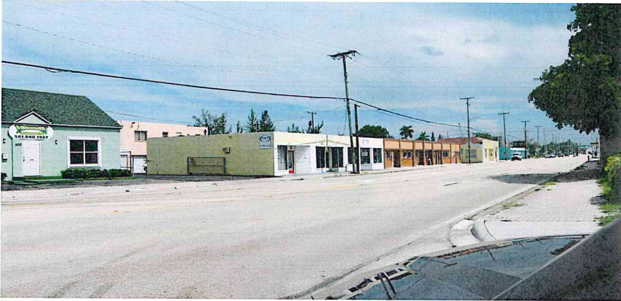
Broadway/US-1 before Improvements (above)

This Capital Improvement Project was added to the adopted CRA Plan in 2011 as a concerted effort to transform the Broadway Corridor, through street improvements, landscaping, and new development regulations.