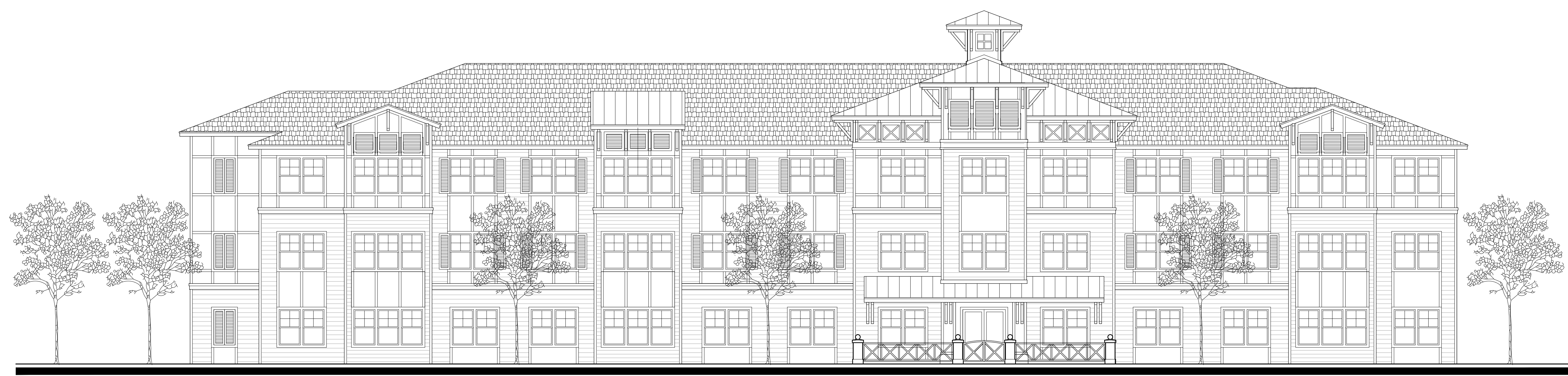
1 BROADWAY STREET ELEVATION SCALE: 1/8" = 1'-0"

ANY REPRODUCTIONS, REVISIONS OR MODIFICATIONS OF THESE DOCUMENTS WITHOUT THE EXPRESS WRITTEN CONSENT OF SLOCUM PLATTS ARCHITECTS, P.A. IS PROHIBITED BY LAW. THE DESIGN IN THESE DRAWINGS ARE THE EXCLUSIVE PROPERTY OF SLOCUM PLATTS ARCHITECTS, P.A. THE COMPANY, EMPLOYEES, RESERVES THE COPYRIGHT AND ALL OTHER PROPERTY RIGHTS IN THESE PLANS AND ELEVATIONS.